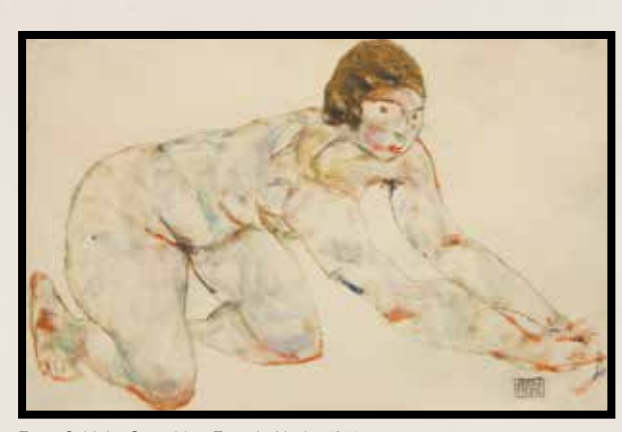
Egon Schiele, Crouching Female Nude, 1914, gouache, watercolour and black chalk on paper, 310 x 480 mm

The gallery W&K - Wienerroither & Kohlbacher, with locations in Vienna and New York, presents works of classical modern and post-war art. In November, highlights by Gustav Klimt, Egon Schiele, Oskar Kokoschka and Alfred Kubin as well as representatives of international modern art such as Lyonel Feininger, Erich Heckel and Ernst Ludwig Kirchner will be presented in Strauchgasse.