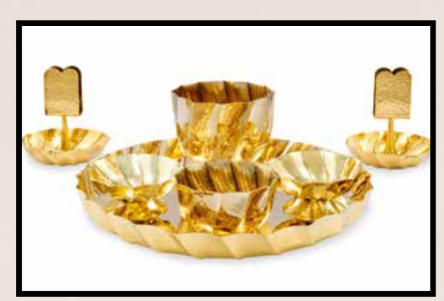
Smoking set, designed by Josef Hoffmann, manufactured by Wiener Werkstätte around 1920, brass, chased and polished, dimensions: tray 32 cm diameter; large cup (cigar bowl) 11,5 x 11 cm