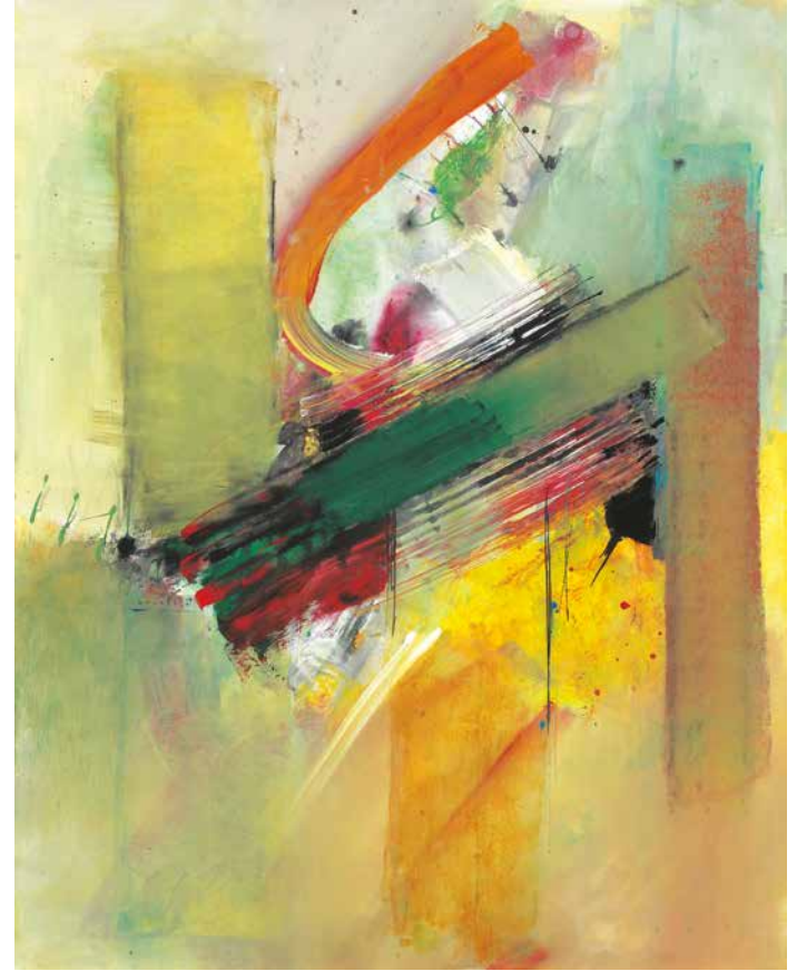
Swinging Manhattan acrylic on canvas 2019, 117,5 x 93,5 cm center left: signed and dated