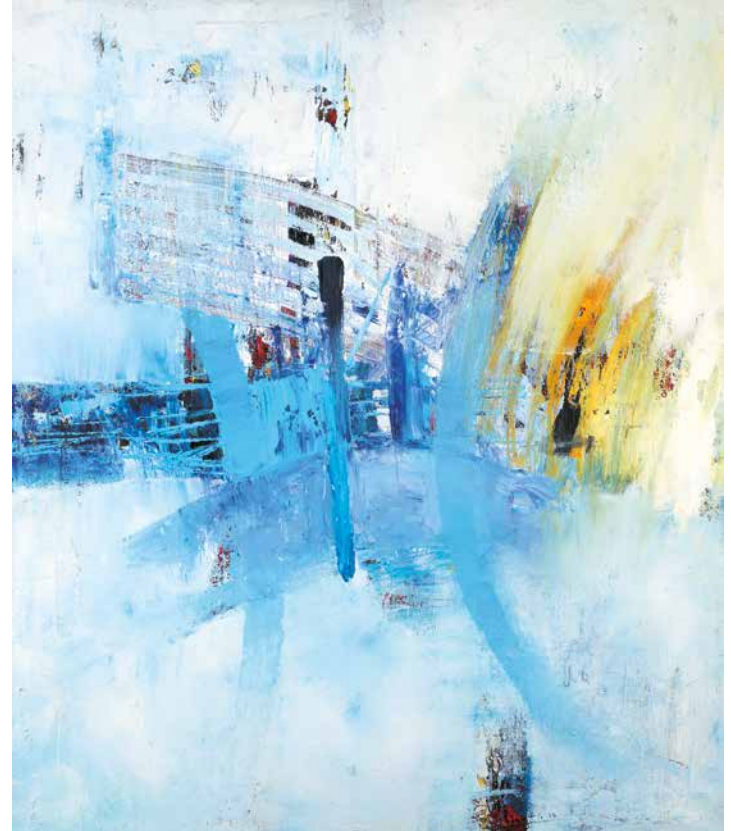
High Seas acrylic on canvas 2013, 140 x 120 cm bottom right: signed and dated