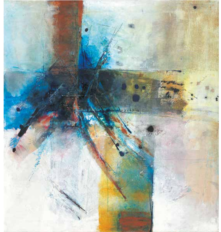
Crossing Over acrylic on canvas 2015, 75 x 70 cm center: signed and dated