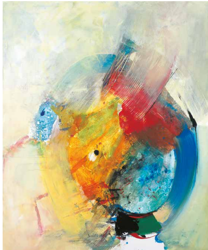
Morning Mirage acrylic on canvas 2019, 120 x 100 cm bottom center: signed and dated