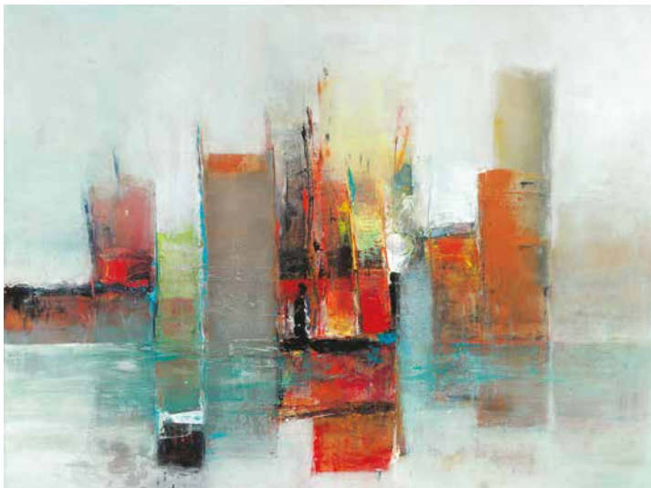
Chicago acrylic on canvas 2018, 90 x 120 cm bottom center: signed and dated