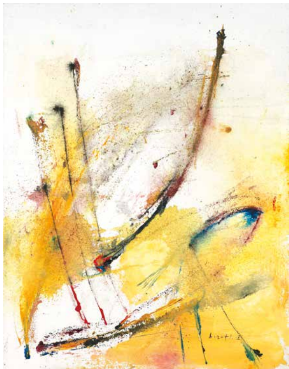
Lines and Stripes II acrylic on jute 2012, 90 x 70 cm bottom right: signed and dated