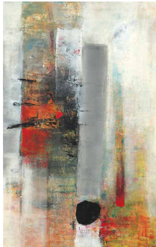
Black Point acrylic on canvas 2016, 110 x 70 cm bottom center: signed and dated