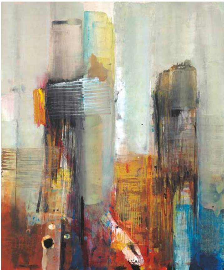
W.A.M. Eine kleine Nachtmusik acrylic on canvas 2018, 120 x 100 cm bottom right: signed and dated