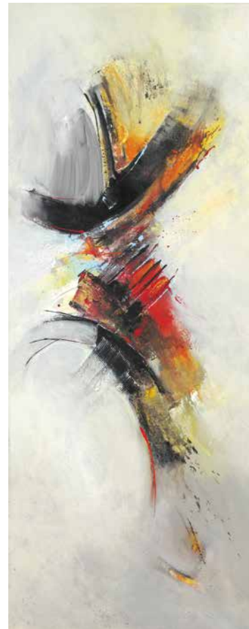
Sailing Home acrylic on jute 2018, 200 x 80,5 cm center left: signed and dated