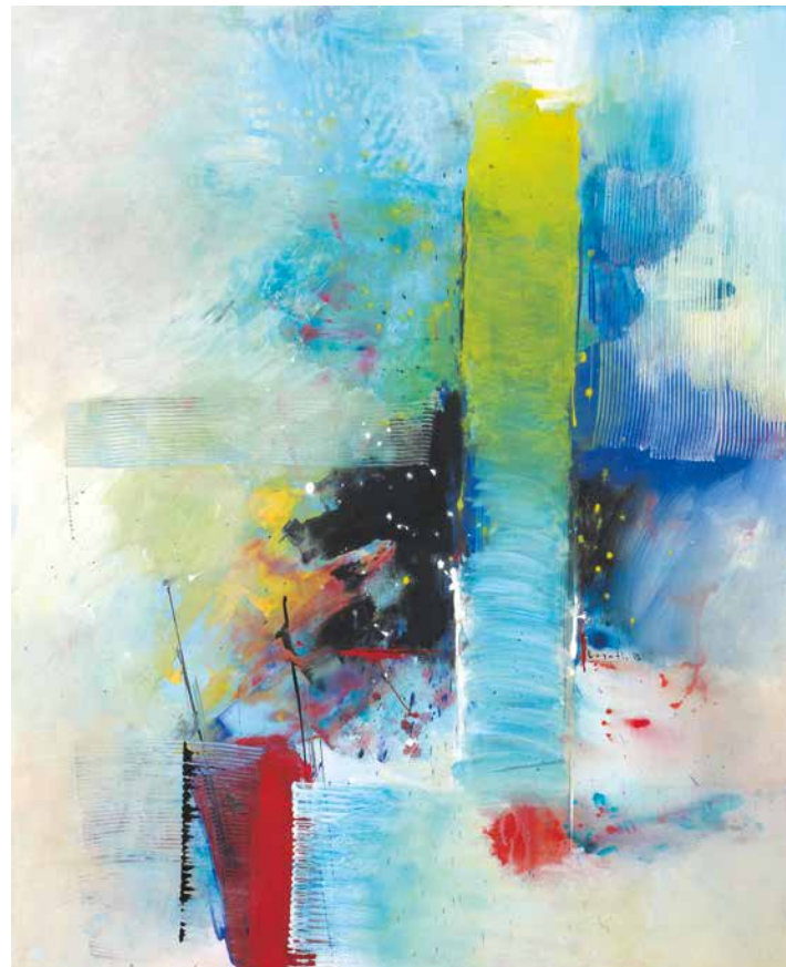
West Hampton Beach acrylic on canvas 2018, 110 x 90 cm bottom right: signed and dated