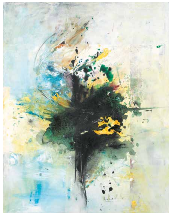
Green Storm acrylic on canvas 2015, 100 x 80 cm center right: signed and dated