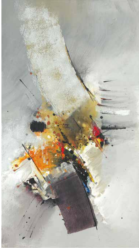
White Stripes on the Grey acrylic on jute 2018, 80 x 45 cm bottom right: signed and dated