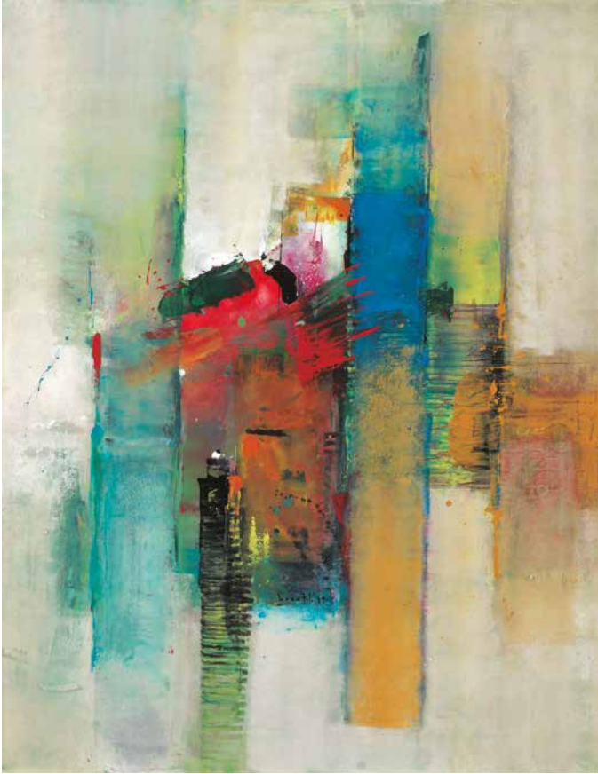
Venice Impressions acrylic on canvas 2019, 116 x 91 cm bottom center: signed and dated