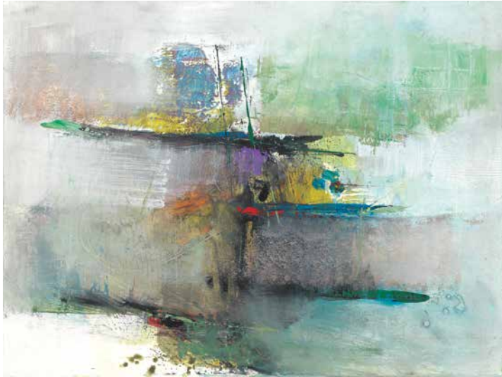
W.A.M. Requiem acrylic on canvas 2019, 60 x 80 cm bottom right: signed and dated