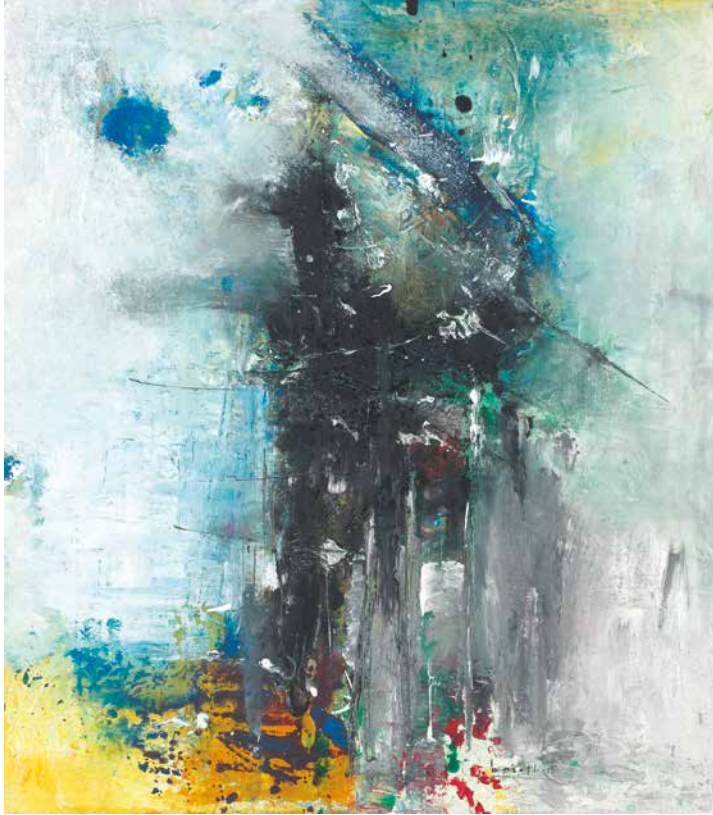
Waterfall acrylic on canvas 2015, 80 x 70 cm bottom right: signed and dated