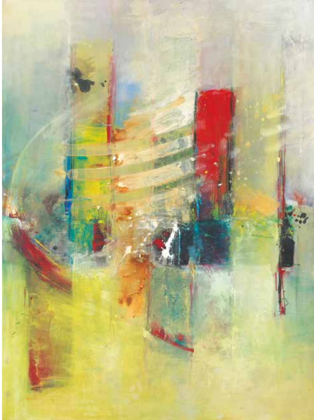
A City's Melodie acrylic on canvas 2018, 120 x 90 cm center right: signed and dated