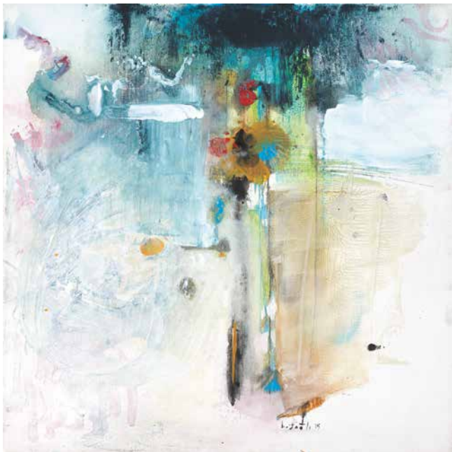
Before the Rain acrylic on canvas 2015, 50 x 50 cm bottom right: signed and dated