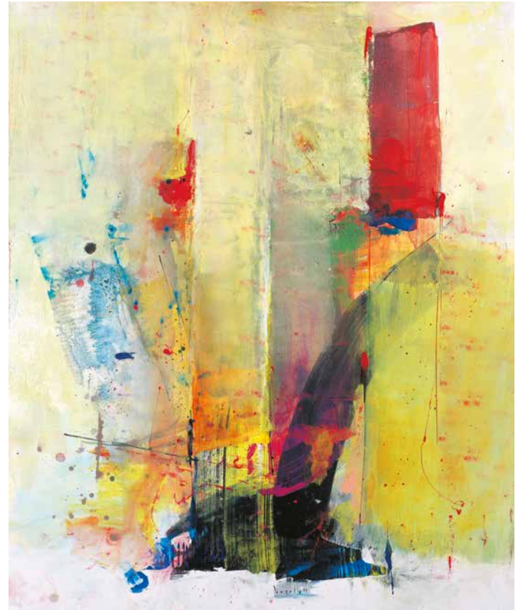
City Highlights acrylic on canvas 2019, 120 x 100 cm bottom center: signed and dated