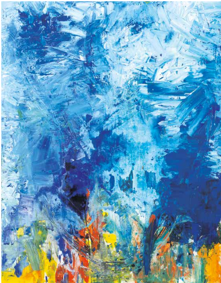
Mediterranien Blues acrylic on jute 2014, 155 x 90 cm bottom center: signed and dated