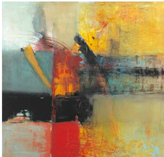
Red and Black Stripes acrylic on canvas 2015, 100 x 105 cm center: signed and dated