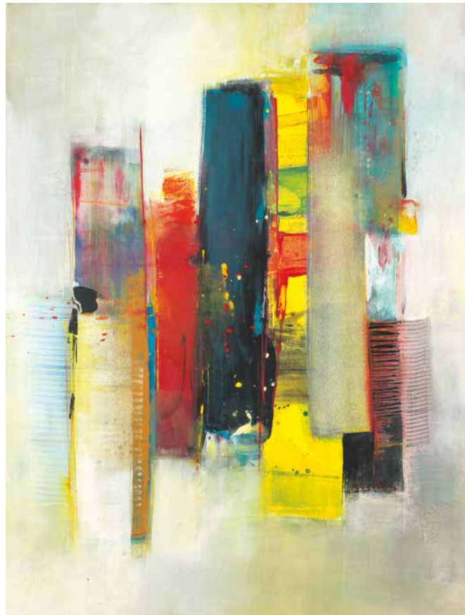
Downtown acrylic on canvas 2018, 122 x 92,5 cm bottom right: signed and dated