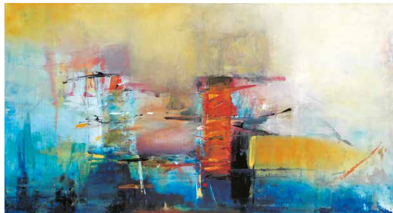
South City acrylic on canvas 2015, 70 x 130 cm bottom right: signed and dated