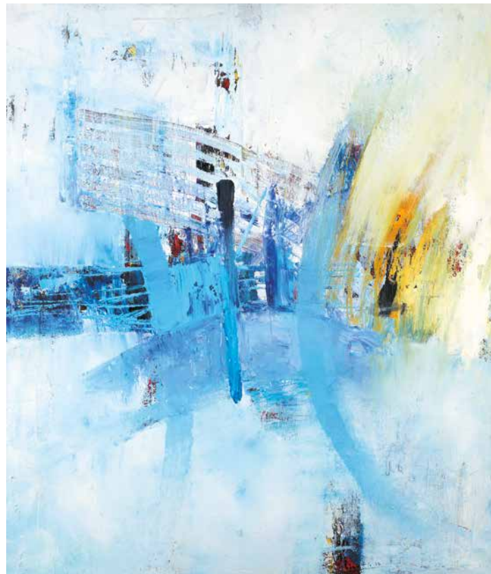
High Seas acrylic on canvas 2013, 140 x 120 cm bottom right: signed and dated