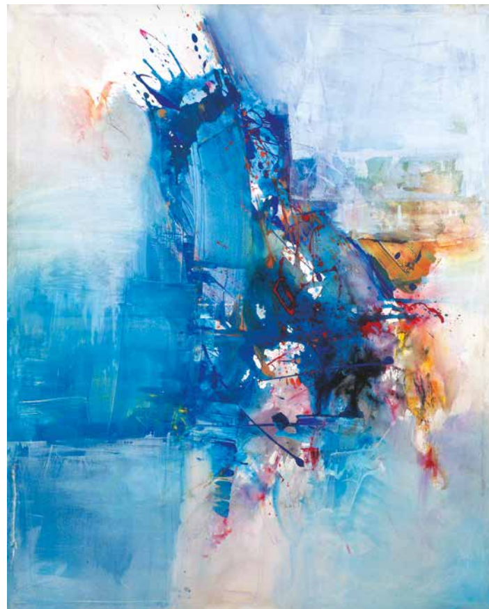
Inside Out acrylic on cavas 2019, 173,5 x 140 cm bottom center: signed and dated