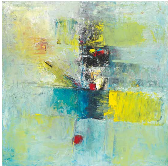
Sun and Sea acrylic on canvas 2016, 120 x 120 cm center right and center left: signed and dated