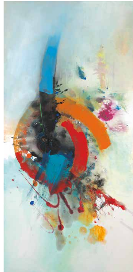
Musical Harmony acrylic on canvas 2019, 200 x 98 cm center: signed and dated