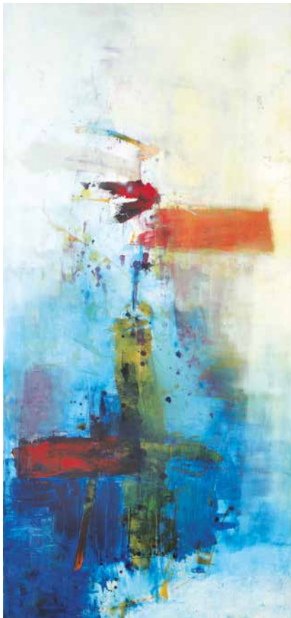
California Dreamin acrylic on canvas 2015, 150 x 70 cm bottom center: signed and dated