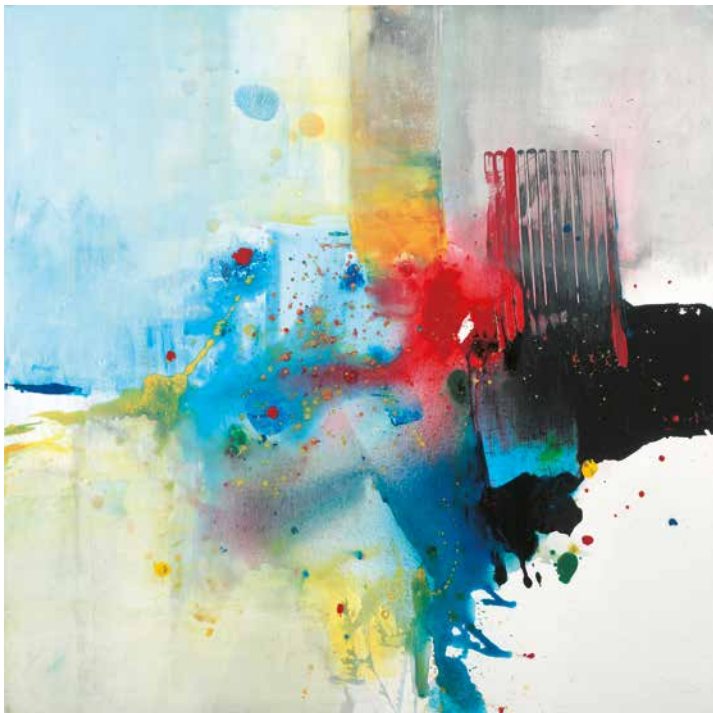
Donau City acrylic on canvas 2018, 100 x 100 cm center right: signed and dated