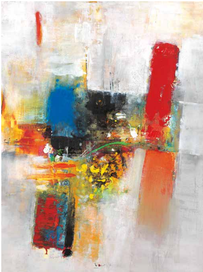
Red on the Grey acrylic on canvas 2016, 120 x 90 cm bottom center: signed and dated