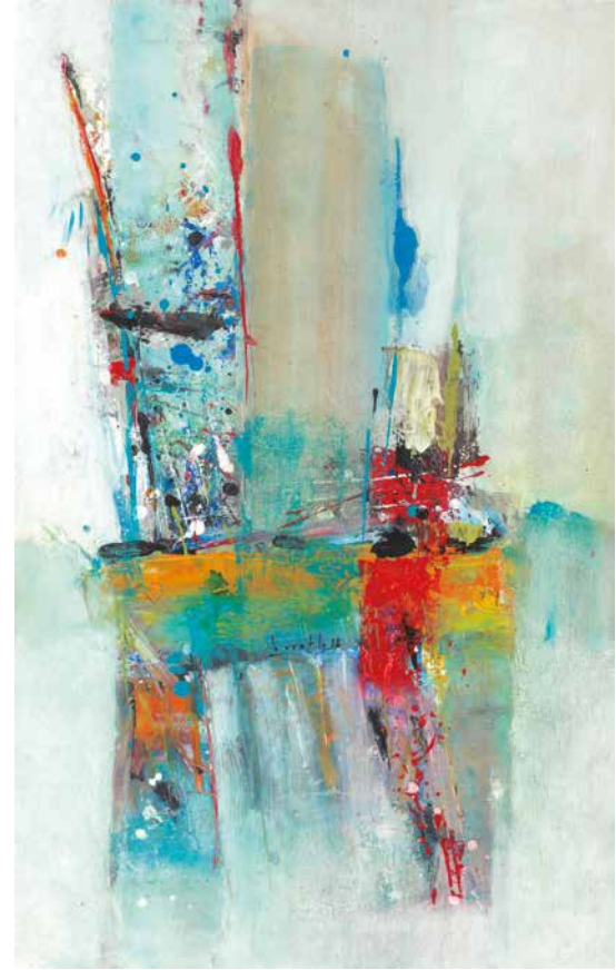
I'm Sailing acrylic on canvas 2018, 80 x 50 cm bottom center: signed and dated