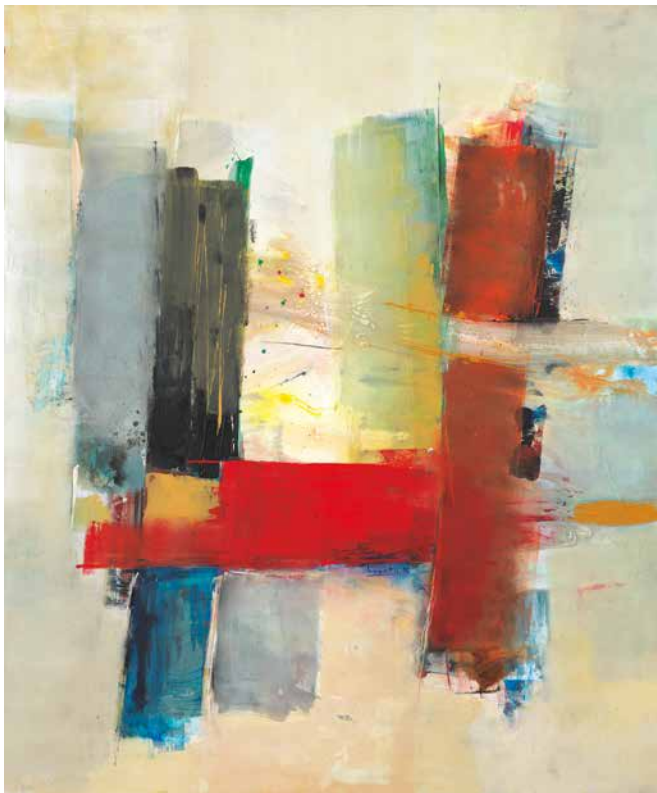
Bridge acrylic on canvas 2018, 120 x 100 cm bottom center: signed and dated