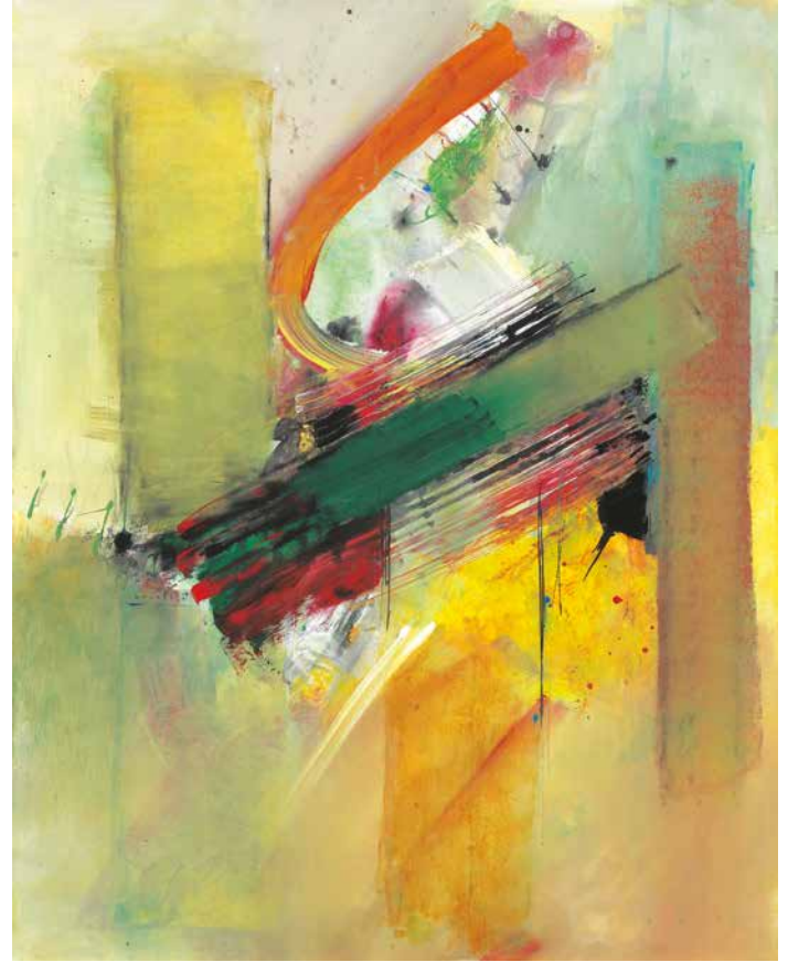
Swinging Manhattan acrylic on canvas 2019, 117,5 x 93,5 cm center left: signed and dated