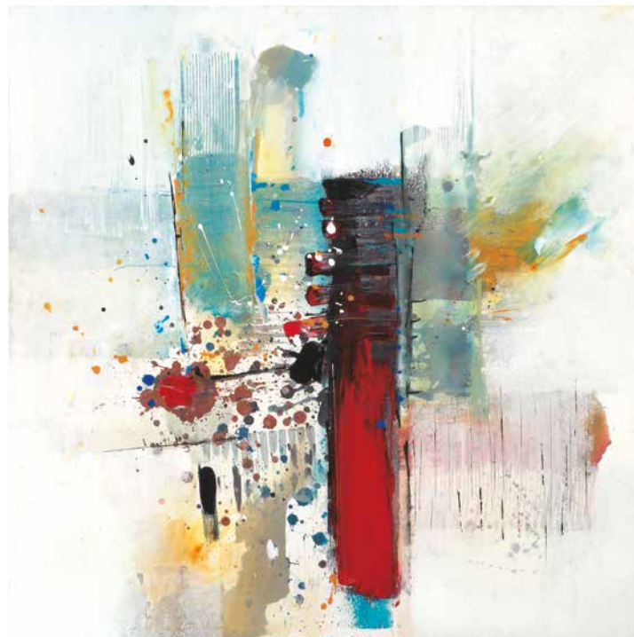
W.A.M. Symphonie 41 acrylic on canvas 2018, 100 x 100 cm center left: signed and dated