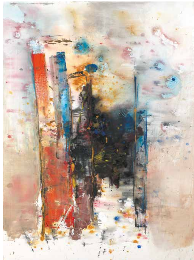
Sag Harbour acrylic on canvas 2018, 120 x 90 cm bottom left: signed and dated