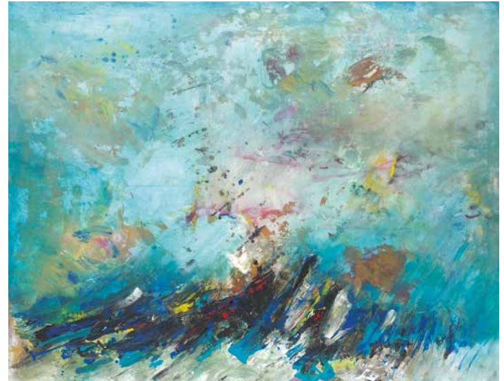
Ocean acrylic on canvas 2018, 100 x 130 cm bottom left: signed and dated