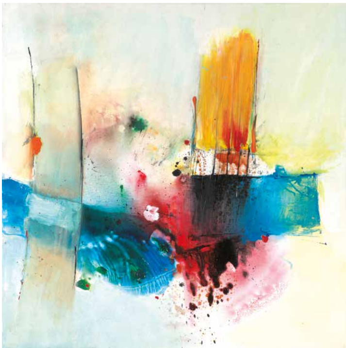
Haus des Meeres acrylic on canvas 2018, 100 x 100 cm center right: signed and dated