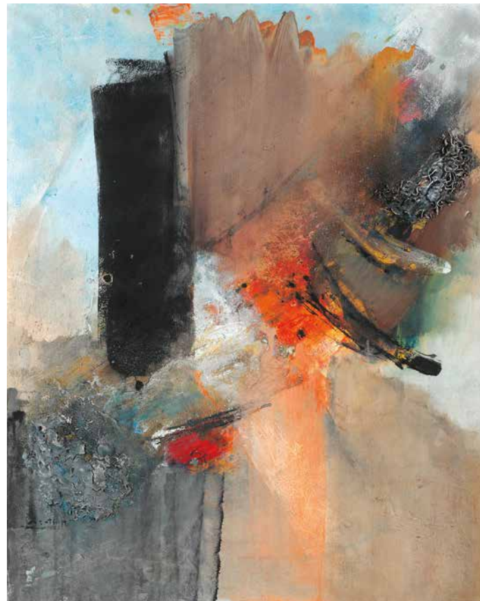
Glut acrylic on canvas 2019, 99 x 97 cm bottom left: signed and dated