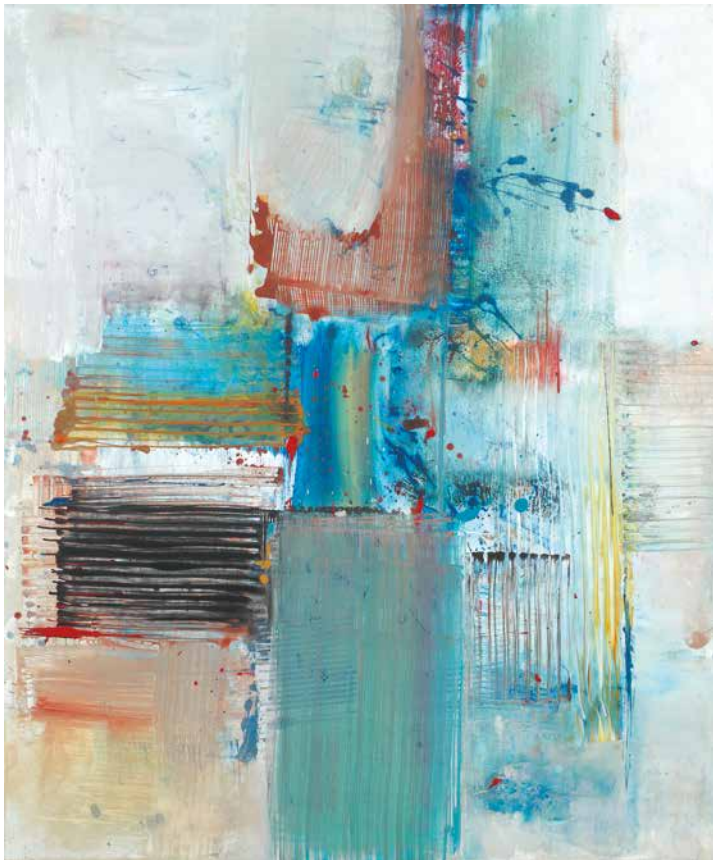
W.A.M. Symphonie 25 acrylic on canvas 2018, 120 x 100 cm center right: signed and dated