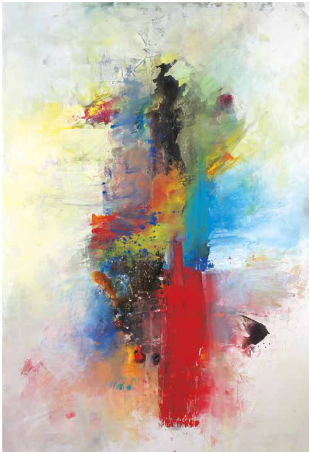
Colourful World acrylic on canvas 2019, 191,5 x 131 cm bottom center: signed and dated