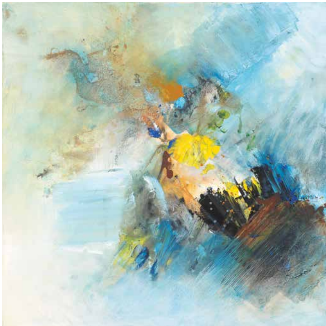
W.A.M. Violin Concert 4 Allegro acrylic on canvas 2019, 80 x 80 cm center right: signed and dated