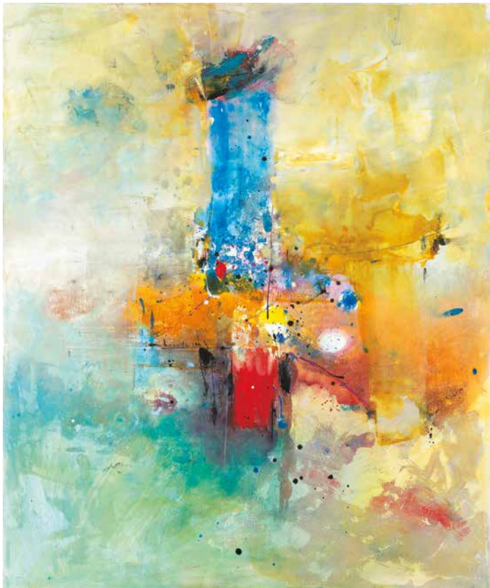
Blue Energy acrylic on canvas 2019, 120 x 100 cm center left: signed and dated