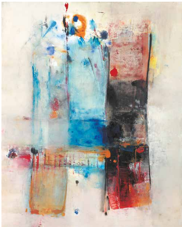
Long Island acrylic on canvas 2018, 100 x 80 cm bottom center: signed and dated