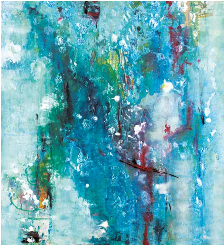
Colours of Sea acrylic on canvas 2015, 115 x 105 cm bottom center: signed and dated